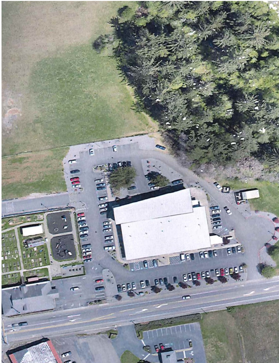
Figure 2 Wellness Center Site Arial View

The District's main facility is the Del Norte Community Wellness Center which opened in 2007. Building this facility took nearly 10 years of effort by the Del Norte Healthcare District, Open Door Community Health Centers and the openhearted support of the city, county, College of the Redwoods, Area 1 Agency on Aging, First Five and many other social service providers in Del Norte County. The Community Wellness Center's location, 550 E. Washington Blvd., was selected for its proximity to the Del Norte Senior Center, social services, public health, Sutter Coast Hospital and for its potential for future location of other health and social services.