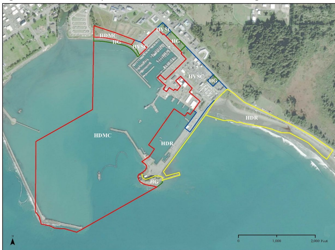
Figure 2: Crescent City Harbor – Coastal Land Use Designations

The LUP update must undergo final certification by the California Coastal Commission. The proposed land use/zoning designations support visitor serving and recreational land uses within the District that allow more flexibility in accommodating diverse uses within the Harbor Area. The proposed Harbor LUP includes four Harbor-specific land use classifications: Harbor Dependent Marine Commercial (HDMC), Harbor Dependent Recreational (HDR), Harbor Visitor Serving Commercial (HVSC) and Harbor Greenery (HG). These proposed land use designations can be seen in Figure 2.